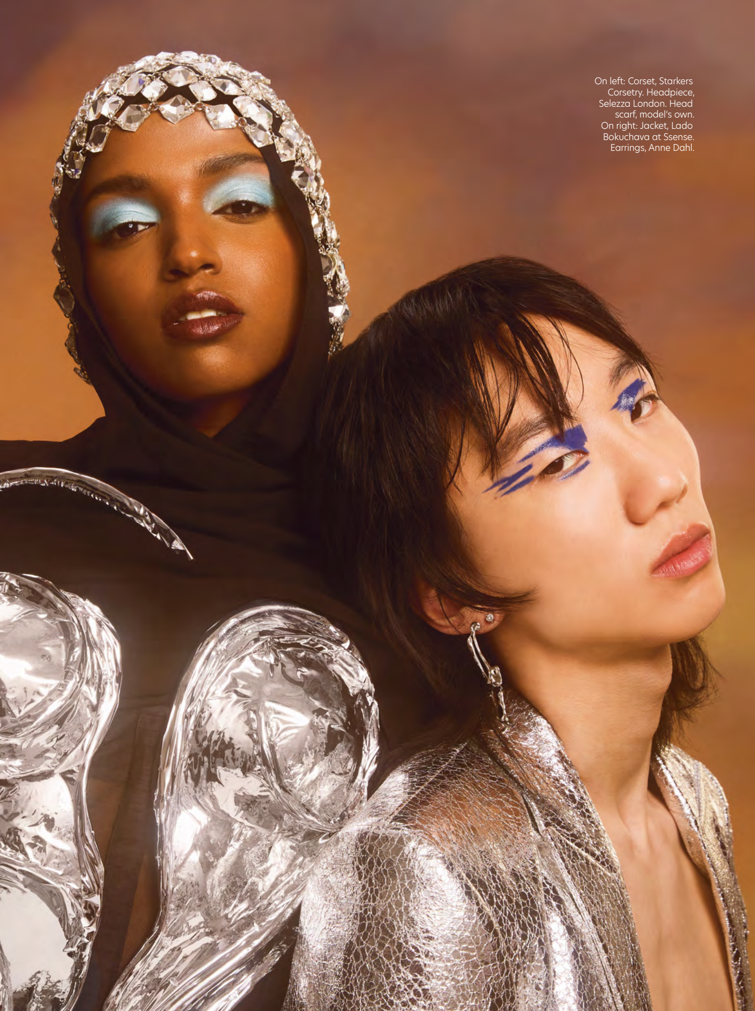
On left: Corset, Starkers Corsetry. Headpiece, Selezza London. Head scarf, model's own. On right: Jacket, Lado Bokuchava at Ssense. Earrings, Anne Dahl.