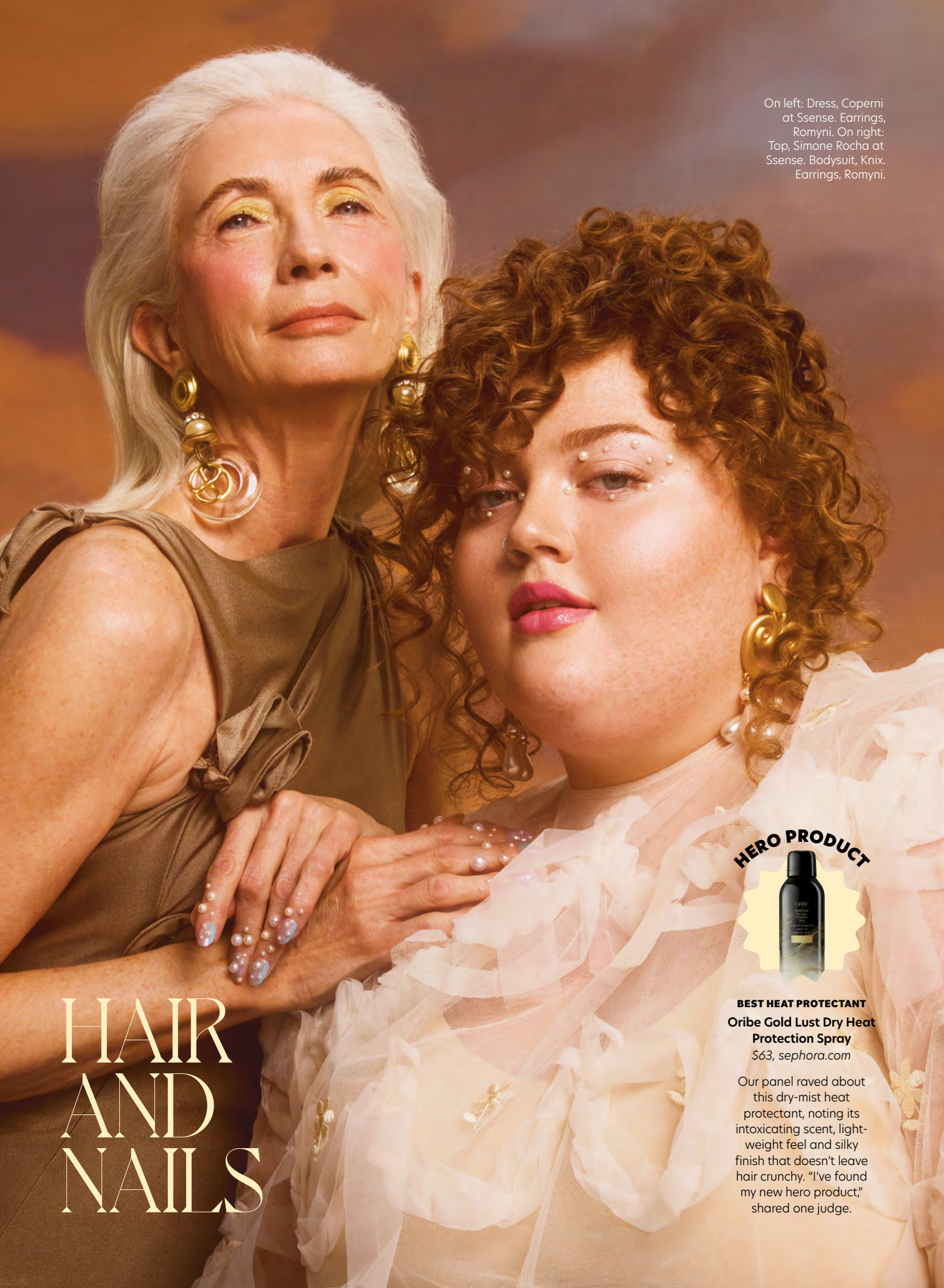
On left: Dress, Coperni at Ssense. Earrings, Romyini. On right: Top, Simone Rocha at Ssense. Bodysuit, Knix. Earrings, Romyini.